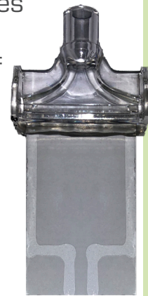
BioChip - Actual Size